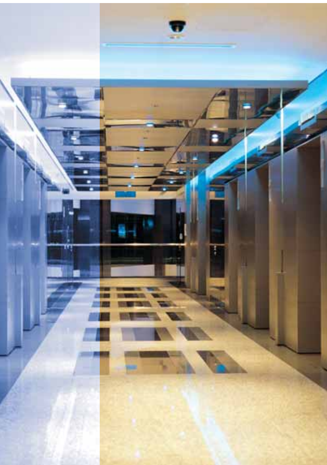
Lobby of the Menara Telekom Building.

One of the 11 systems that makes up Menara Telekom's IBMS is the Clipsal C-Bus Addressable Lighting Control System (ALCS). It is the largest installation in Malaysia, with over 3,700 C-Bus units controlling over 6,500 individual circuits. These units are located throughout the building in areas such as corridors, meeting rooms, toilets, the auditorium, carpark, server rooms and outside garden areas.