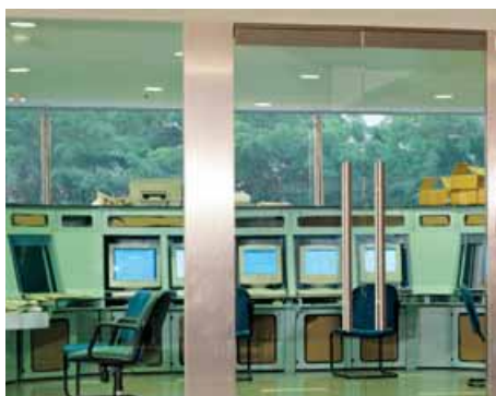
Telekom Control Room.